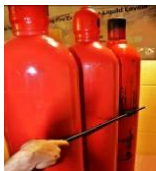
Transducer Extension Rod in use