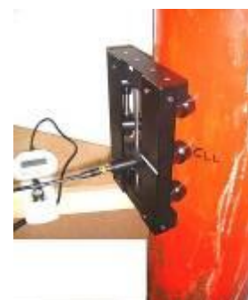
Optional Robo Transducer in use